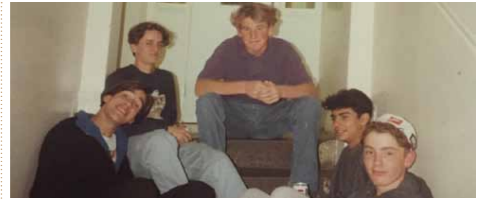
Re-creating their photograph 20 years later: OBs in Wendron-Gordon in 1995, and today in 2015

At the end of the day some of our guests kindly recorded their memories of Llanwrtyd Wells and Bromsgrove with the History Department and current pupils. These oral history recordings will form part of the School archive, which will enrich the teaching and learning of the School's history for generations to come.