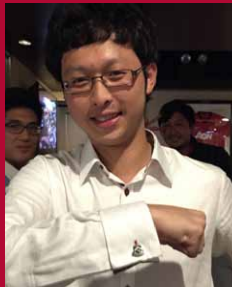
Showing off the special Housman Hall cufflinks