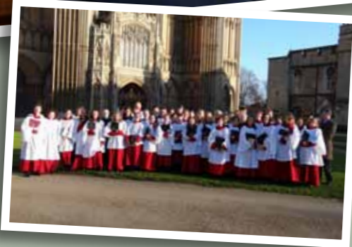
Our Chapel Choir sang Evensong at Peterborough Cathedral and featured heavily in the commercial CD recording of Advent to Christmas . There were no fewer than 275 singers present on the recording from Year 2 to Upper Sixth.

“Extra-Curricular gives pupils a wide range of opportunities.”