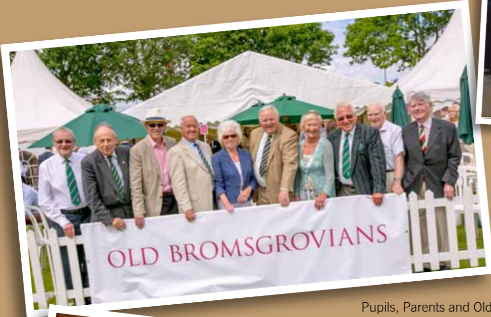
Pupils, Parents and Old Bromsgrovians joined together to celebrate the School's annual Commemoration Day. We were particularly delighted to welcome a group of former pupils from Wendron-Gordon who were celebrating their 20th anniversary.

A LOOK BACK AT THE ACADEMIC YEAR 2014/15.