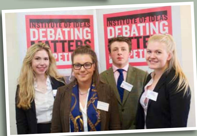
Sixth Form teams reached the Regional Finals of the Debating Matters and European Youth Parliament competitions, whilst others made it to the Quarter-Finals of the English-Speaking Union Mace Competition and won the Michael Holt Debate.