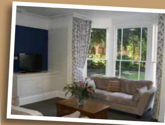
Hazeldene, the first of the girls' day Houses to undergo refurbishment over the summer of 2015, re-opened and was ready for business at the start of term in September.