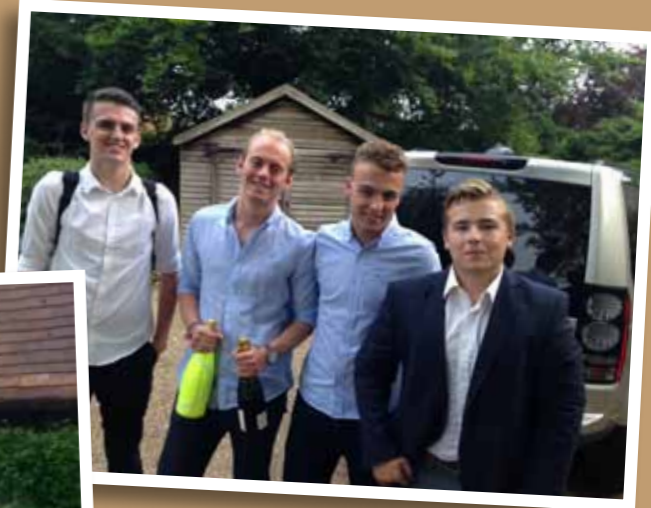
A Level, IB, BTEC and GCSE Pupils celebrated their superb exam results over the Summer. 85% A*, A & B at A level, 39 point average for IB and 85% A* to B at GCSE.