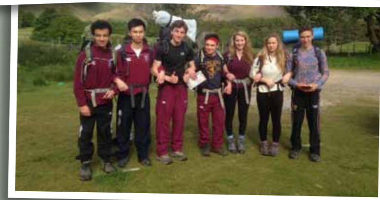
Thirty-four pupils have received their Gold Duke of Edinburgh Award since September, with a further eighty gaining Silver and 134 gaining Bronze.