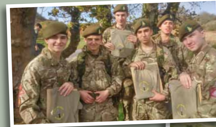
The CCF has a strength of 400 cadets, and we are proud of our partnership with two local high schools.