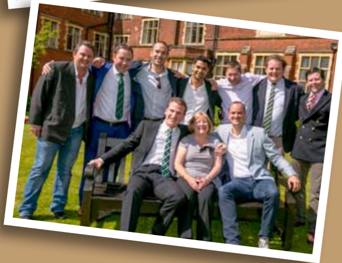
The cast of LEAR Inc. performed a six-day run of the drama production at the Edinburgh Fringe Festival in August 2015. They were delighted to see a number of Parents, Old Bromsgrovians and Friends of the School in the audience.