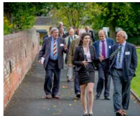
OBs on tour around the School with current pupils