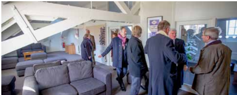
Old Bromsgrovians looking around the current study areas on the top floor of Thomas Cookes House