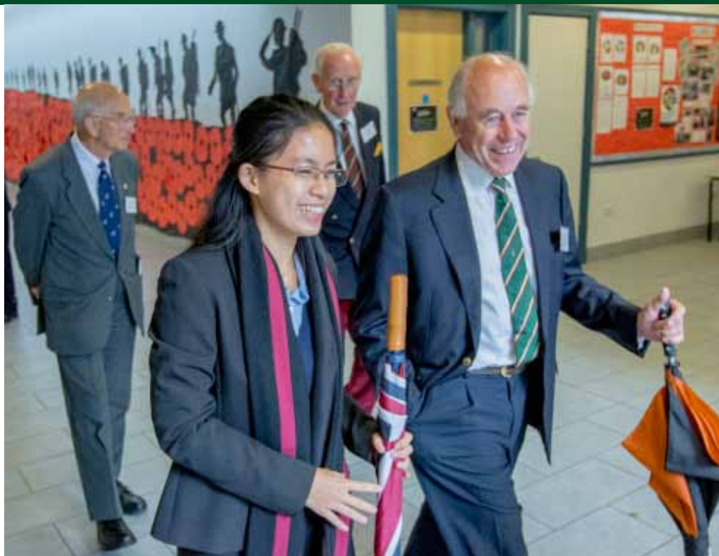
Reunited: Old Bromsgrovians at the Pre-1960s Reunion enjoy a tour of the School with current pupils