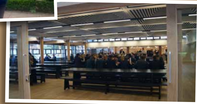
The dining room, originally opened in 1965 by The Queen Mother, has undergone a complete transformation over the last 12 months. The dining hall officially re-opened to hundreds of excited and hungry pupils and staff in September 2015.