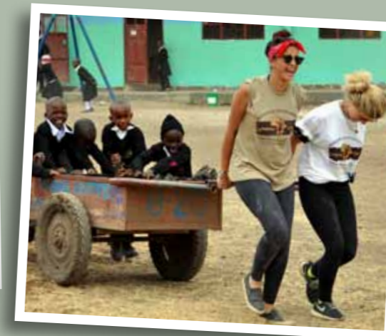
A Bromsgrove School expedition party worked closely with the Good Hope orphanage and school in Arusha, Tanzania. The pupils raised over £1000 to help the school build a library.