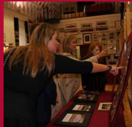
OBs looking at their House photos in the Old Chapel