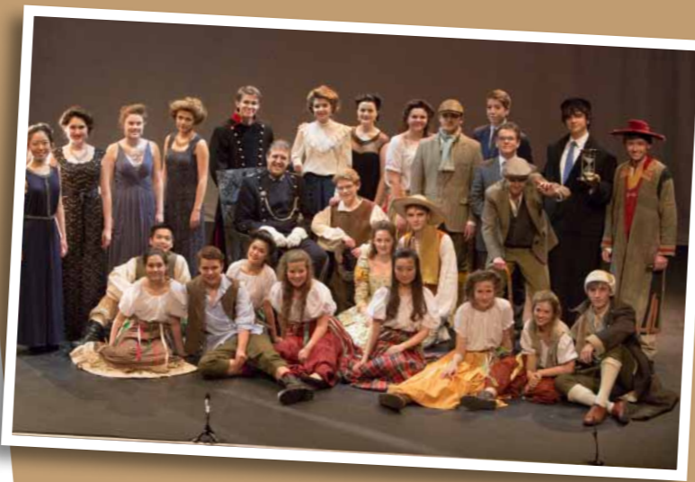
William Shakespeare's The Winter's Tale was the School's major production of the year.