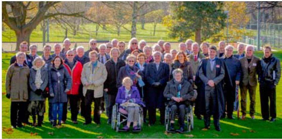
Old Bromsgrovians and guests in attendance at the Cookes House Reunion

During tours of the current Thomas Cookes House, many OBs visited the original 18-bedder on the top floor (which some still believe is haunted) and recounted tales of their school days whilst looking around Cookes Room, their former library. Guests later sat down to lunch in the Hospitality Suite where the reminiscences continued.